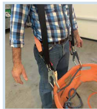
Item: Harness SAFE TRANSFER with hooks for stretcher Description: Set with 2 harnesses Art.no.: 29600

SAFE TRANSFER has developed a harness specially designed to carry a stretcher and still have both hands available for safe transport of the injured person at stairways, slippery areas etc. Easy to wear and adjust.