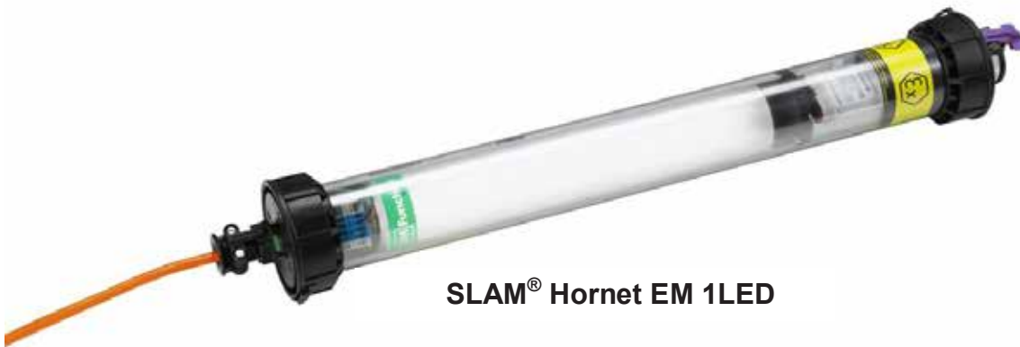
SLAM® Hornet EM 1LED

Thank you for choosing SLAM® Hornet –portable work light with battery back up for your job site. Purpose of this manual is to provide you all the necessary safety and product information to conduct your job conveniently and without any risks for health and safety.