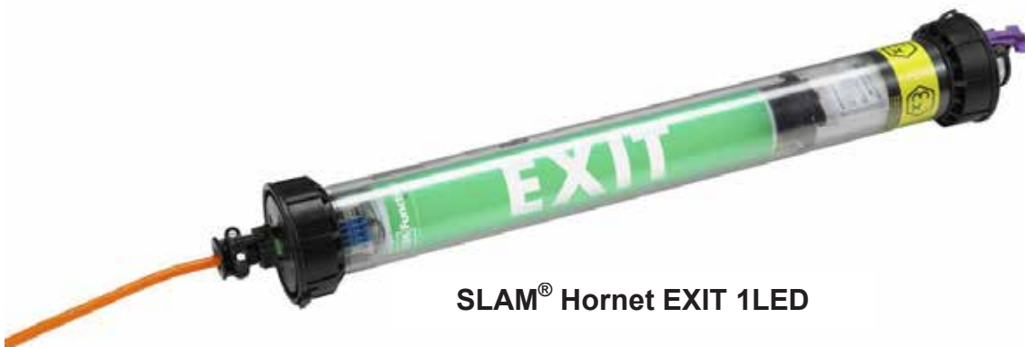
SLAM® Hornet EXIT 1LED